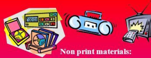
Non print materials: CD-Audio/Video